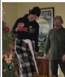
Love (IB Sweden) enjoys a warm gift or two.....