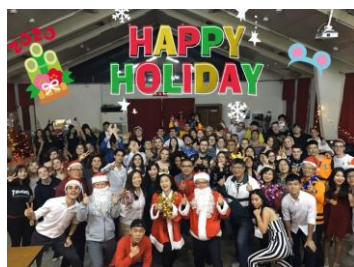
Taiwan RYE hosted a party for all of their 2019-20 IB and Rotex!