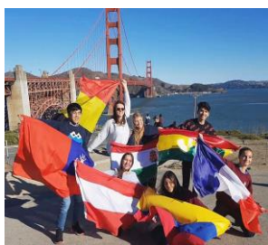
Golden Gate Bridge San Francisco 2018-19!