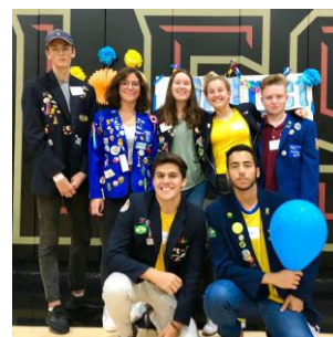
2019-20 IB's assist at the 2019 Interact District Conference Excellent job!!