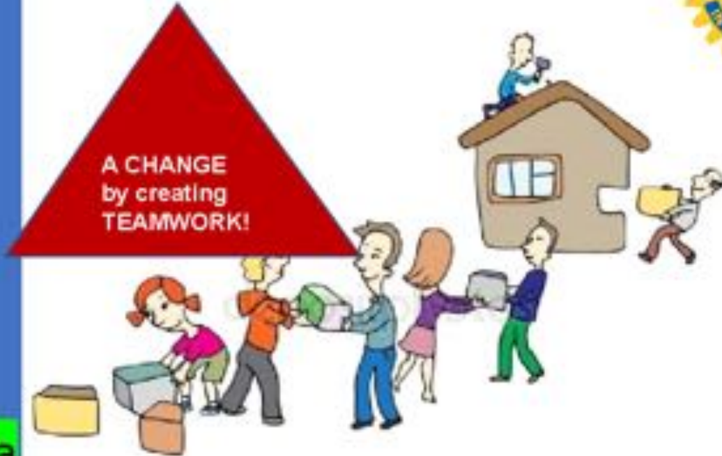
A Rotarian Integrated Community Model