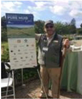
John Muir Land Trust