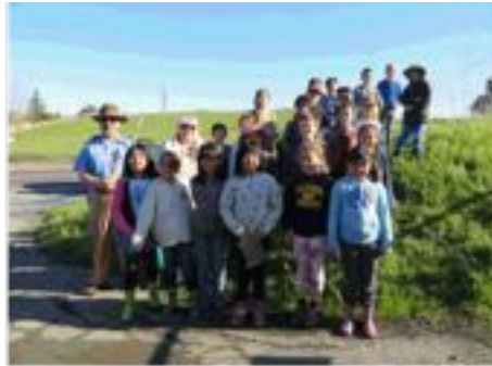
3 rd Grade Study Trip