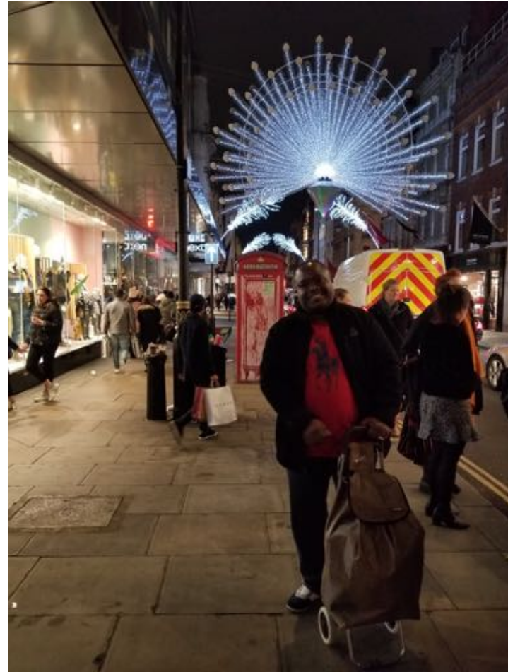
A recent trip to London