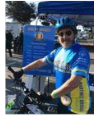
Bike the Bridges for Special Olympics